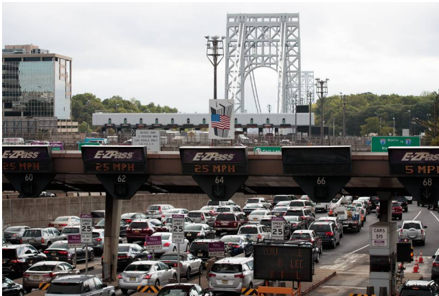
Traffic approaching the George Washington Bridge in Fort Lee, N.J. In 2013, massive traffic jams ensued when access lanes to the bridge were closed in what prosecutors say was a scheme to punish the mayor of Fort Lee for not endorsing Gov. Chris Christie.